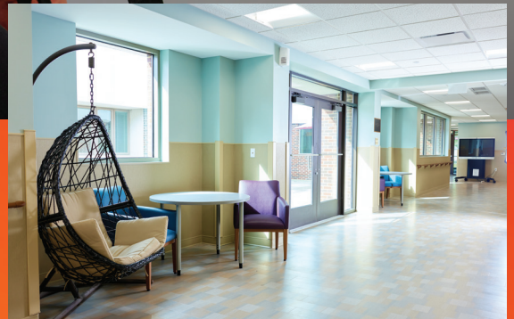
Inset: Newly widened hallways and brighter spaces