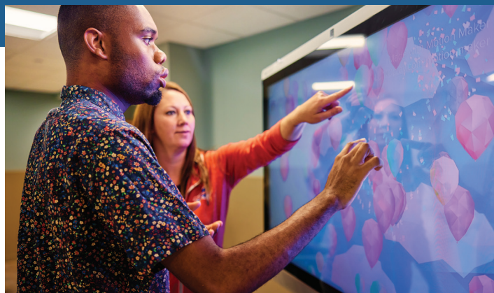
Smartboard technology promotes independence and creates individualized opportunities for learning and practicing motor skills.

Switch technology and advancements in interfaces allow individuals we support the opportunity to enjoy so many daily activities. Those with decreased motor function or dexterity can operate a blender or a mixer with a single "switch" on their iPad to help create the tastiest treats – brownies and cookies are some favorites.