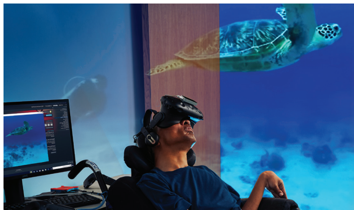
Virtual Reality can transport people to worlds beyond their wildest dreams. Advancements in VR allow people to immerse themselves in their favorite places across the globe through Google Earth.