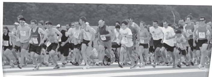
The start of the 5K Run... and they're off!